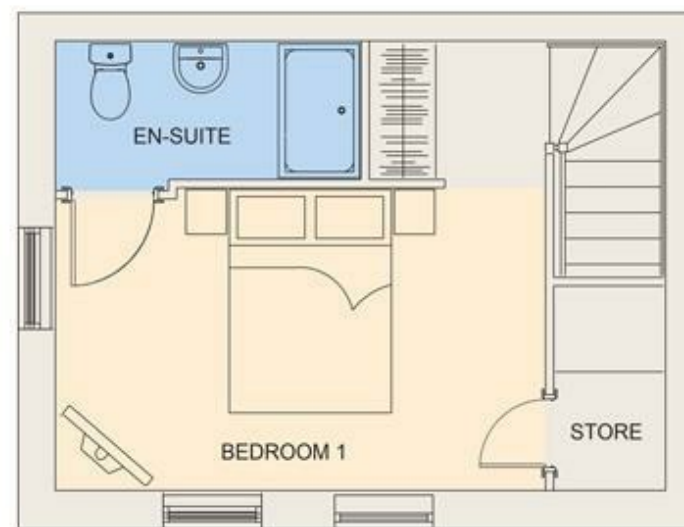
Floor Plan | Second Floor