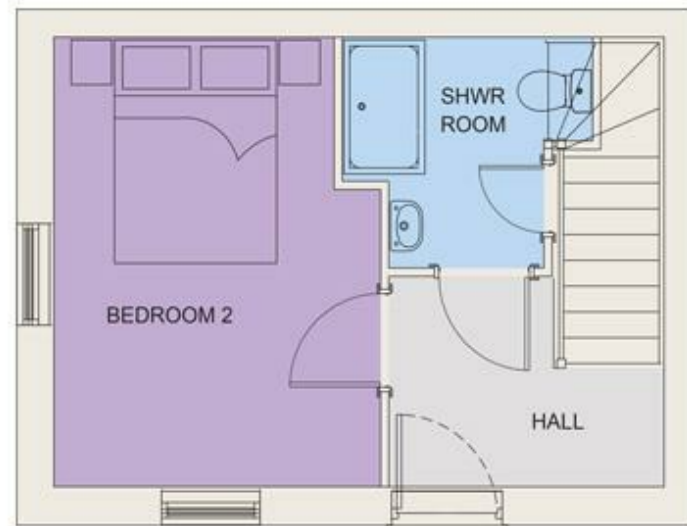
Floor Plan | Ground Floor

E propertyenquiries@charleslouis.co.uk T 0161 959 0166 www.charleslouishomes.co.uk